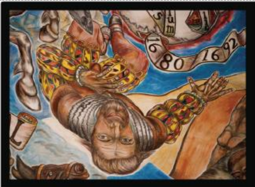
Expulsion of the Spanish Pueblo Revolt