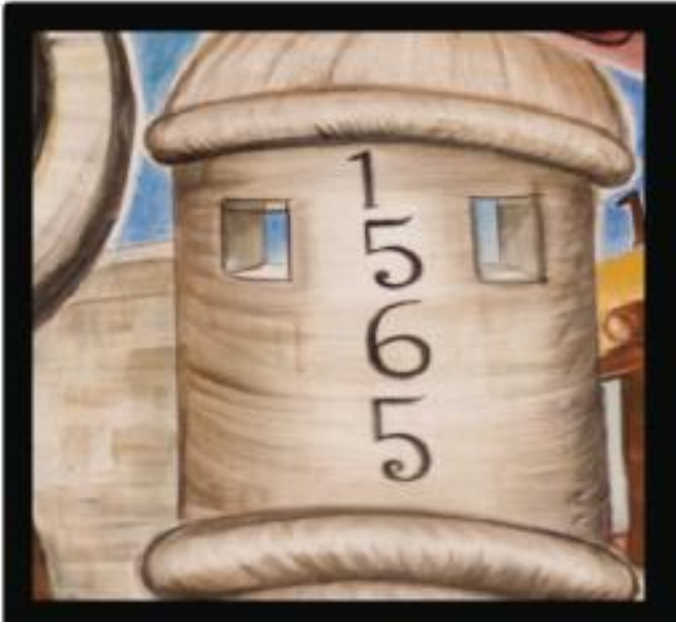
1565 Beginning of Spanish Colonial Period