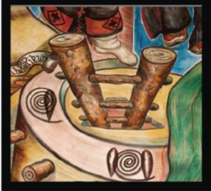
Ladders Used to Enter Pueblo Structure