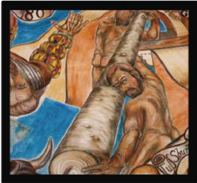
The First Permanent Settlement: Missoin San Gabriel