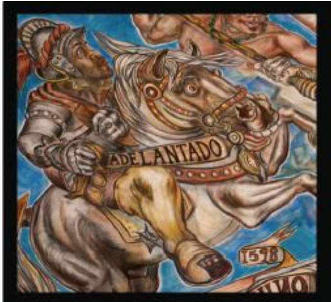
Conquistadores 1598- Juan de Oñate