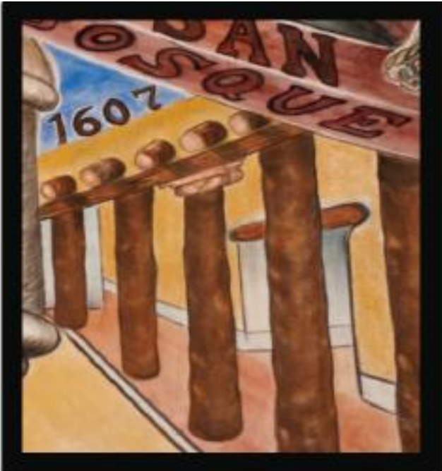
Palace of the Governors