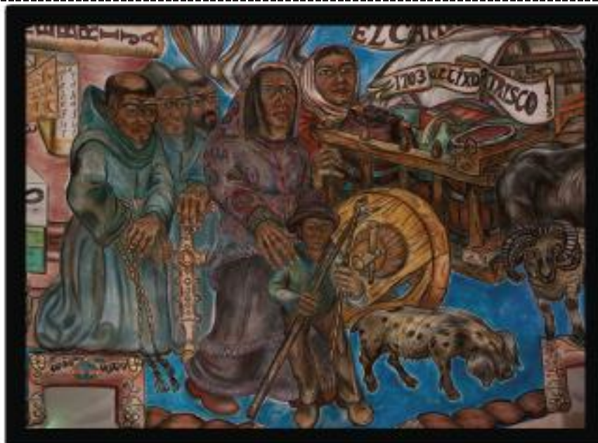
El Camino Real