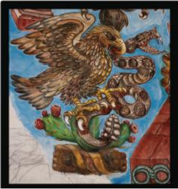
Mexican Coat of Arms