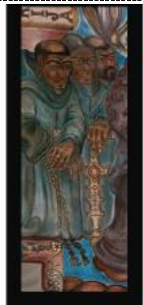
Franciscans Come to New Mexico