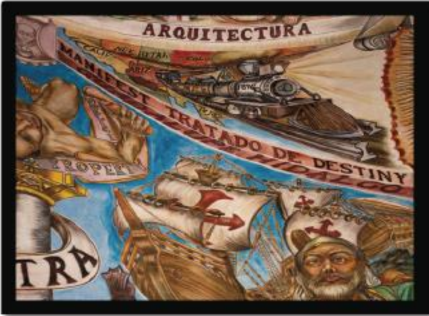
Railroad in New Mexico